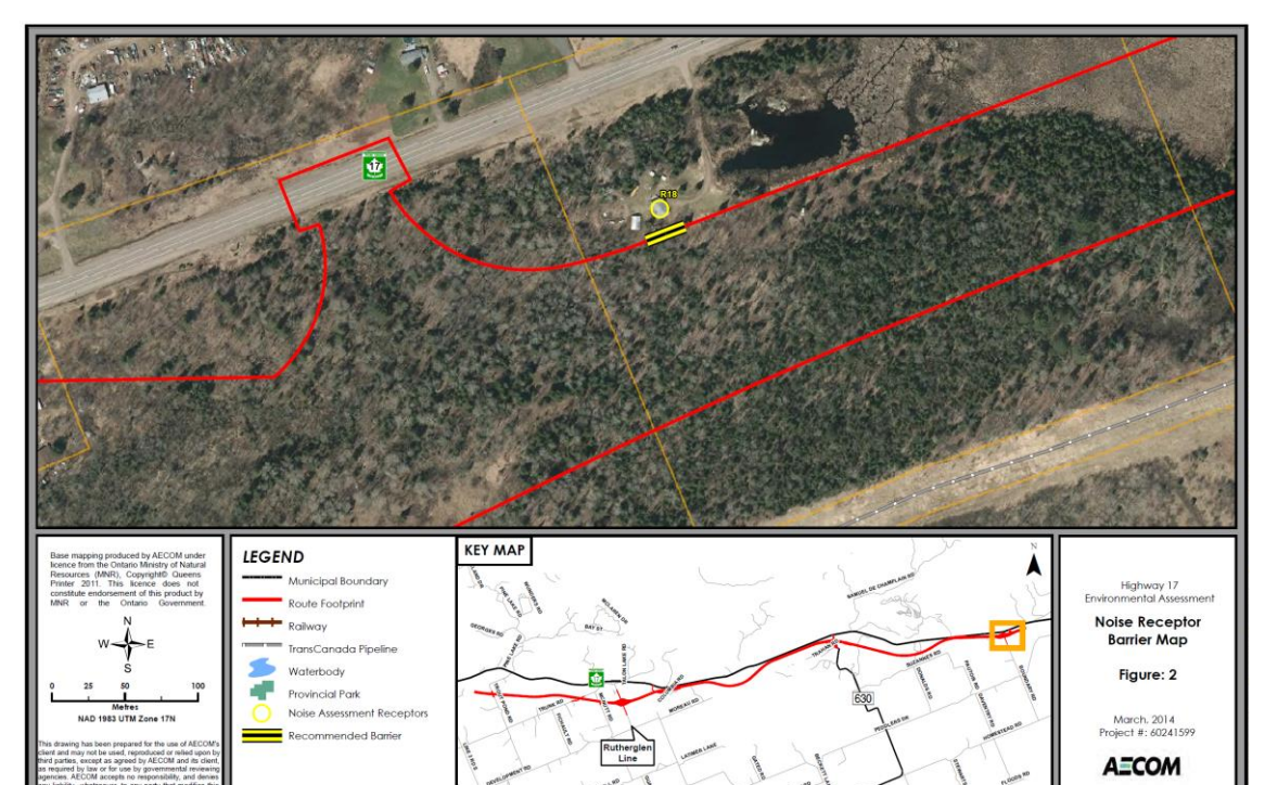
Exhibit 8.7: Location (R18) Where Noise Mitigation Warranted and Feasible

The Guide requires that the noise study documentation address the following for construction noise: