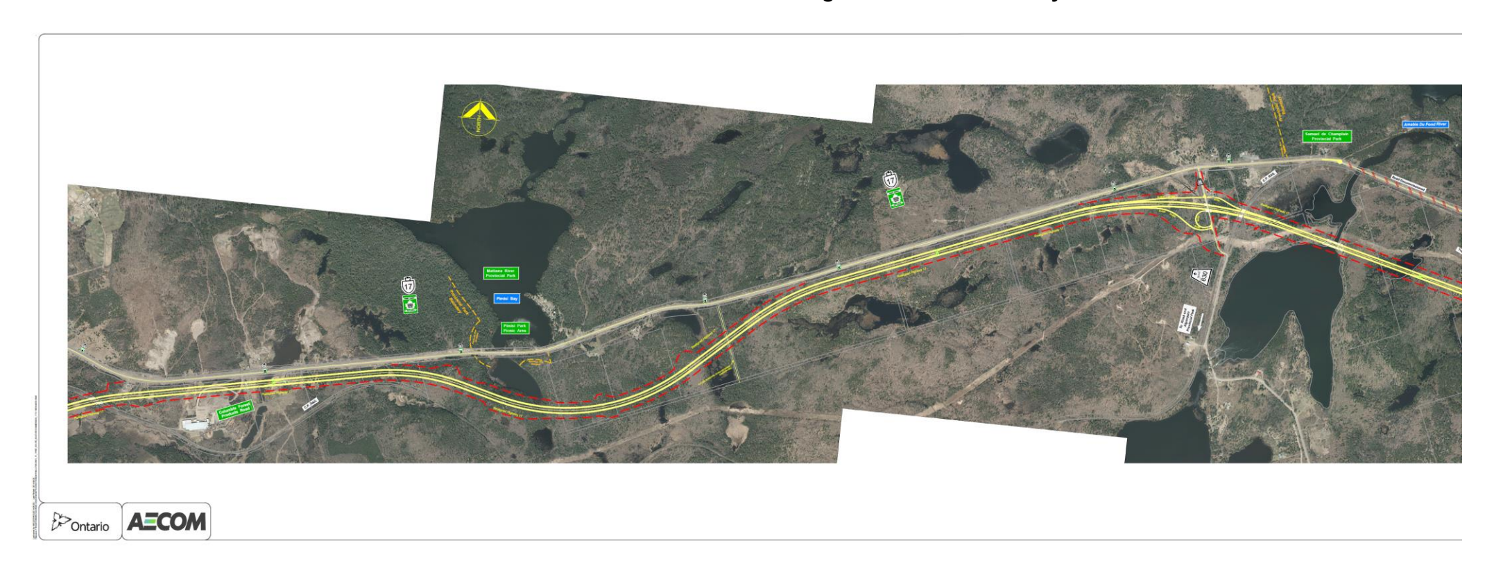
Exhibit 7.3: Preferred Plan – East of Rutherglen to East of Boundary Road